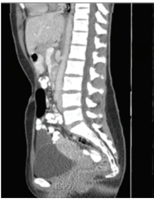
Figure 1. Computed tomography scan (sagittal and coronal views) showing the large fluid-filled multi-septated pelvic cyst.