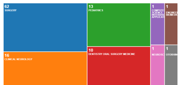
Web of Science

There were 33 duplicates that were found out amongst the databases which were later removed, leaving the final number to 366 scientific papers being included for screening. After careful examination of abstracts, 320 articles were excluded due to the reason codes (Table 1), leaving 46 articles for the full-text (FT) analysis. FT analysis was carried out to find if the articles were pertaining to the information that was consistent with the RQ under consideration. Further 29