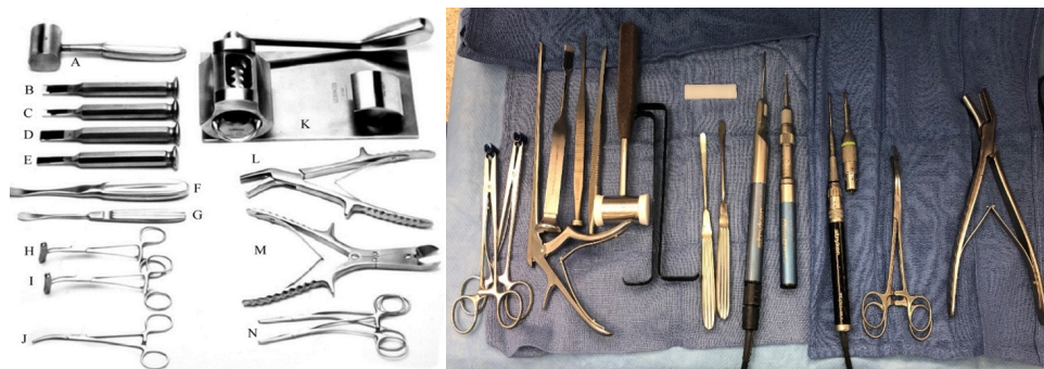
Figure 1. Comparison of tools presented (left) in A Man from Héric: The Life and Work of Paul Tessier, MD, Father of Craniofacial Surgery. Figure 27.1. with the tools used (right) by craniofacial surgeons for a sagittal craniosynostosis case in 2020 at UI Hospital.

RQ - Are there certain engineering technologies mentioned in the existing literature that will result in advancing CVR surgery to be more accurate, predictable and repeatable so that it would directly translate in improving surgical outcomes?